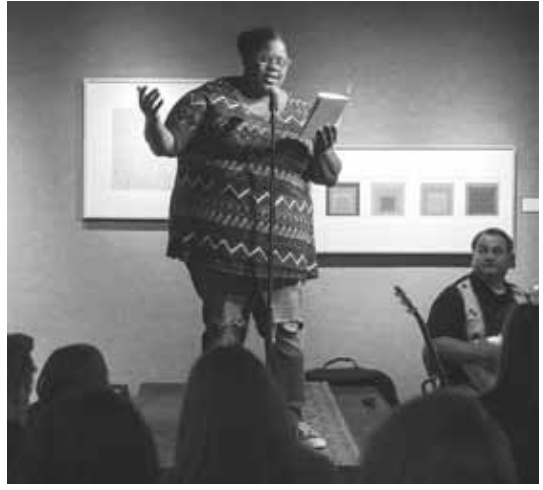
April 2019 Poetry Slam.