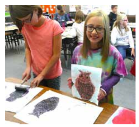
Ucon Elementary School Outreach